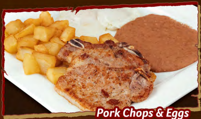
Pork Chops & Eggs

Beans • Potato • Mexican Sausage Ham • Bacon • Sausage • Fried Pork Skin Cactus • Dried Meat