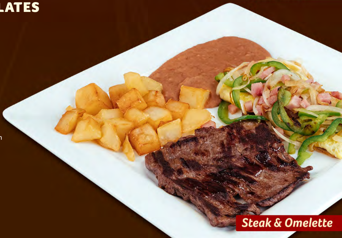
Steak & Omelette