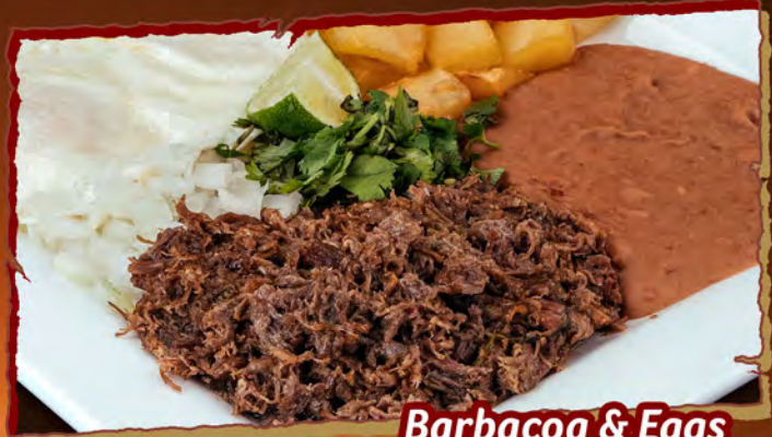
Barbacoa & Eggs