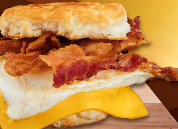
Biscuit with Bacon