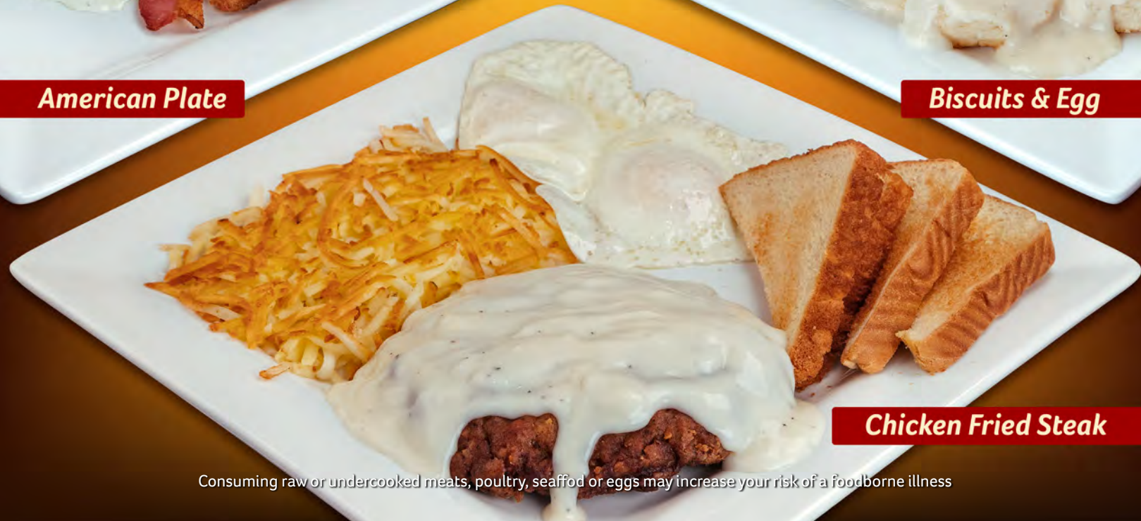
Chicken Fried Steak

Consuming raw or undercooked meats, poultry, seafood or eggs may increase your risk of a foodborne illness