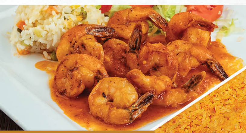
Camarones a la Diabla