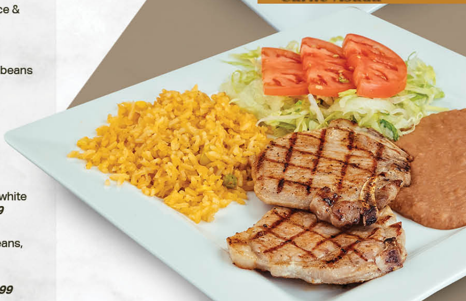
Pork Chop Plate