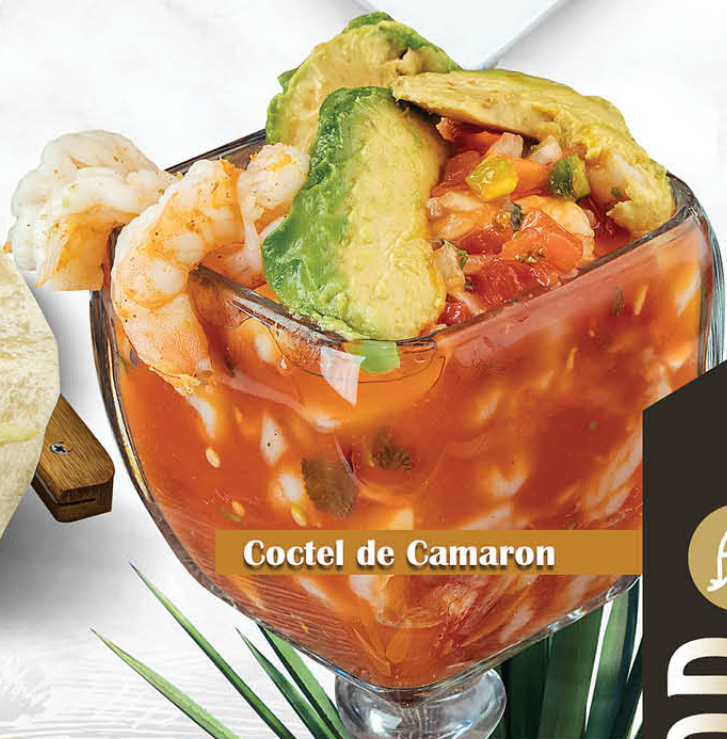
Coctel de Camaron