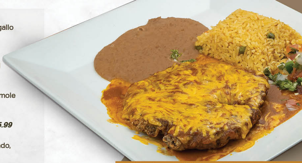
Mexican Chicken Fried Steak

1 cheese enchilada, one ground beef tostada & one pork tamale topped with gravy & cheese. Served with rice & beans - 13.99