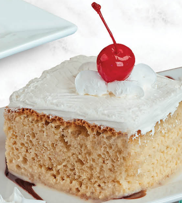
Tres Leches Cake