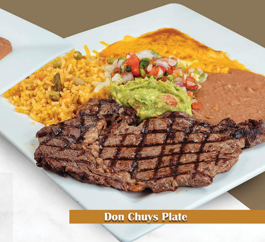
Don Chuys Plate