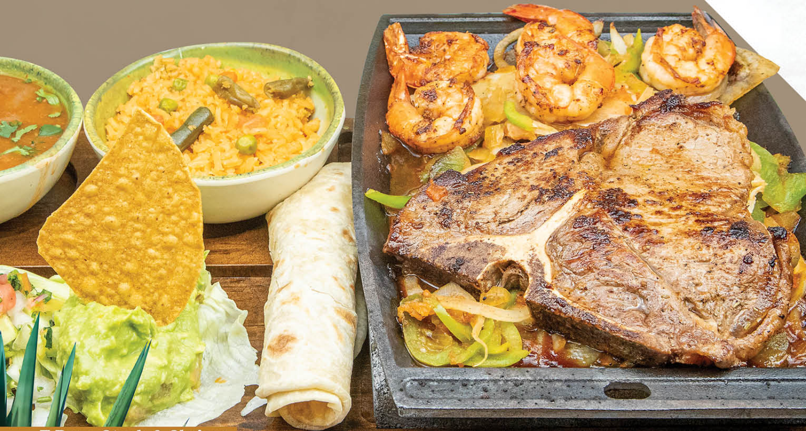
T-Bone Steak & Shrimp