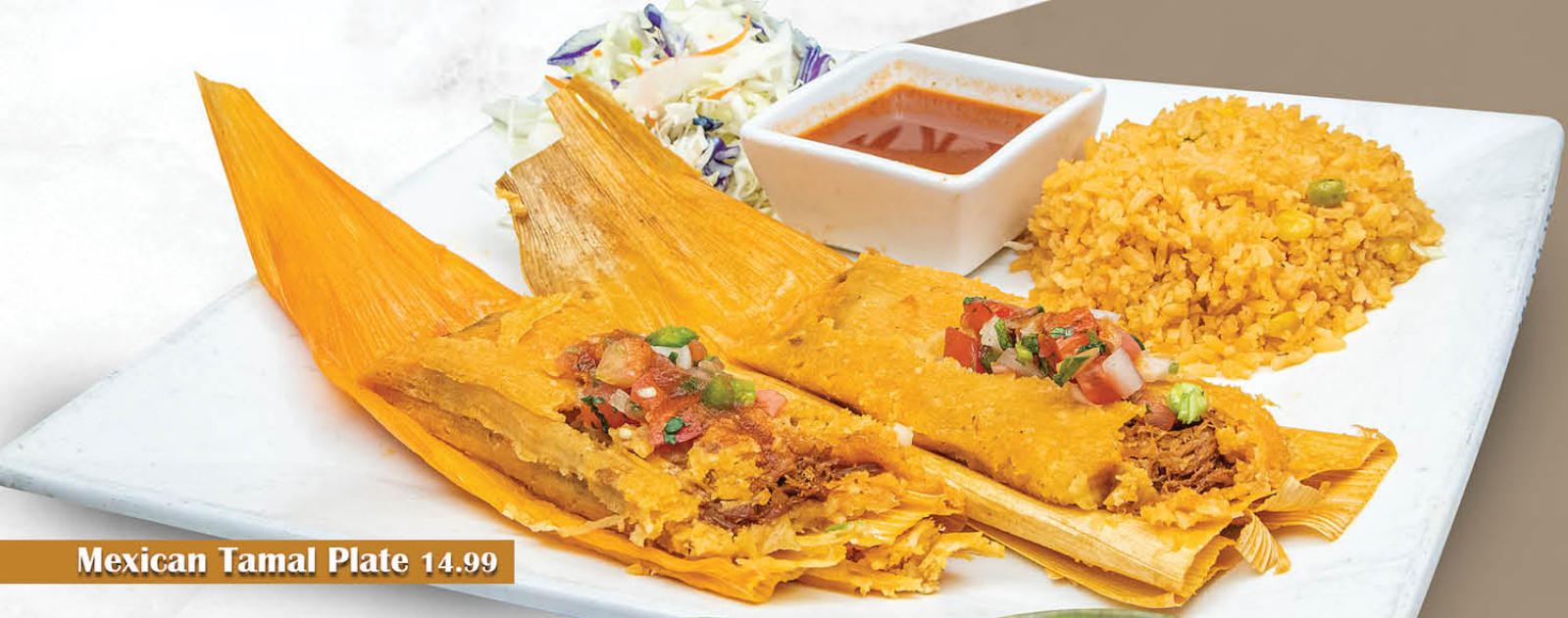
Mexican Tamal Plate 14.99