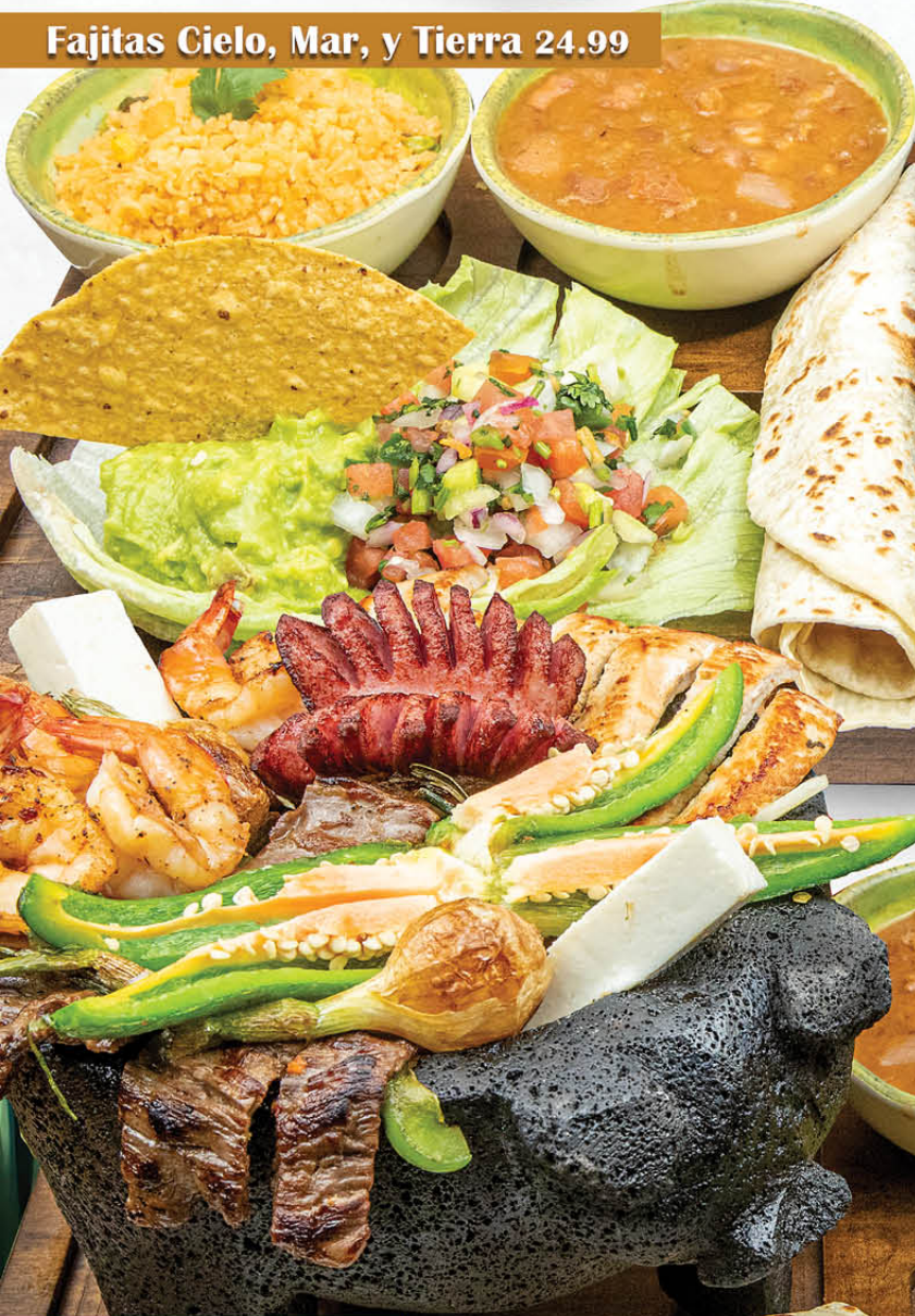
Fajitas Cielo, Mar, y Tierra 24.99