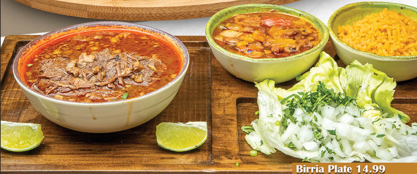
Birria Plate 14.99