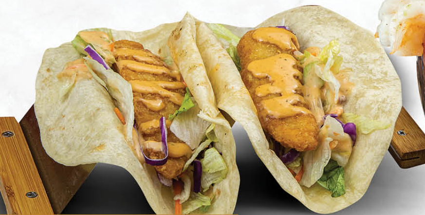
Boom Boom Tacos