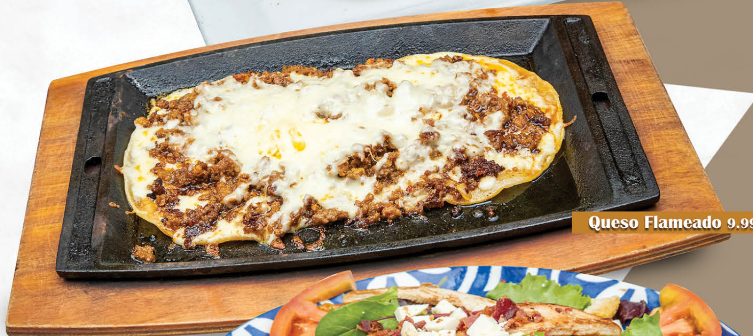
Queso Flameado 9.99