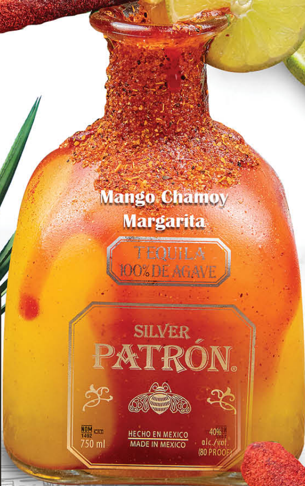
Mango Chamoy Margarita