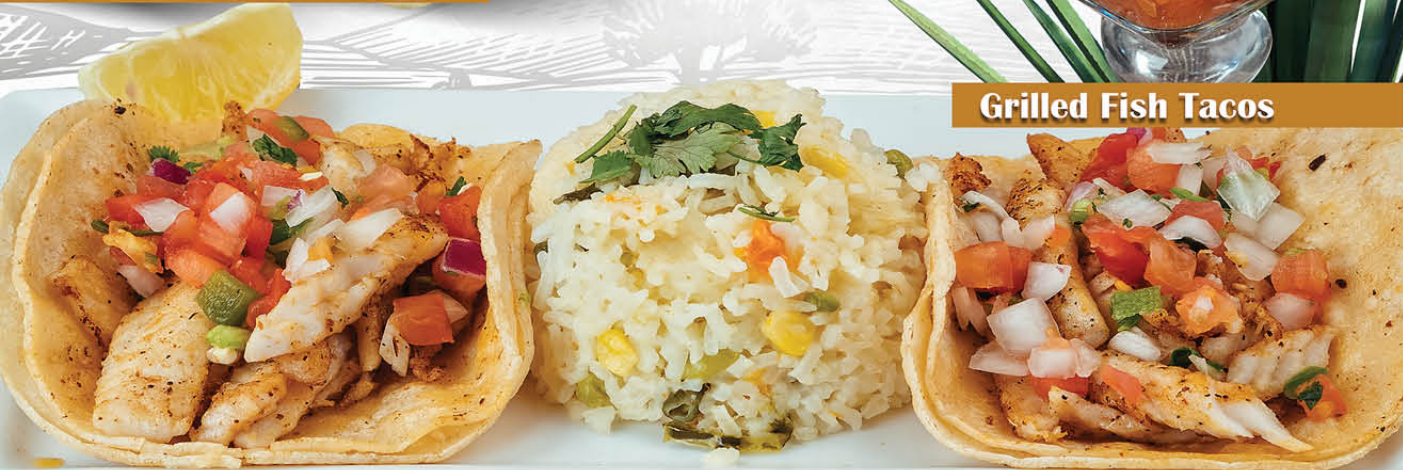
Grilled Fish Tacos