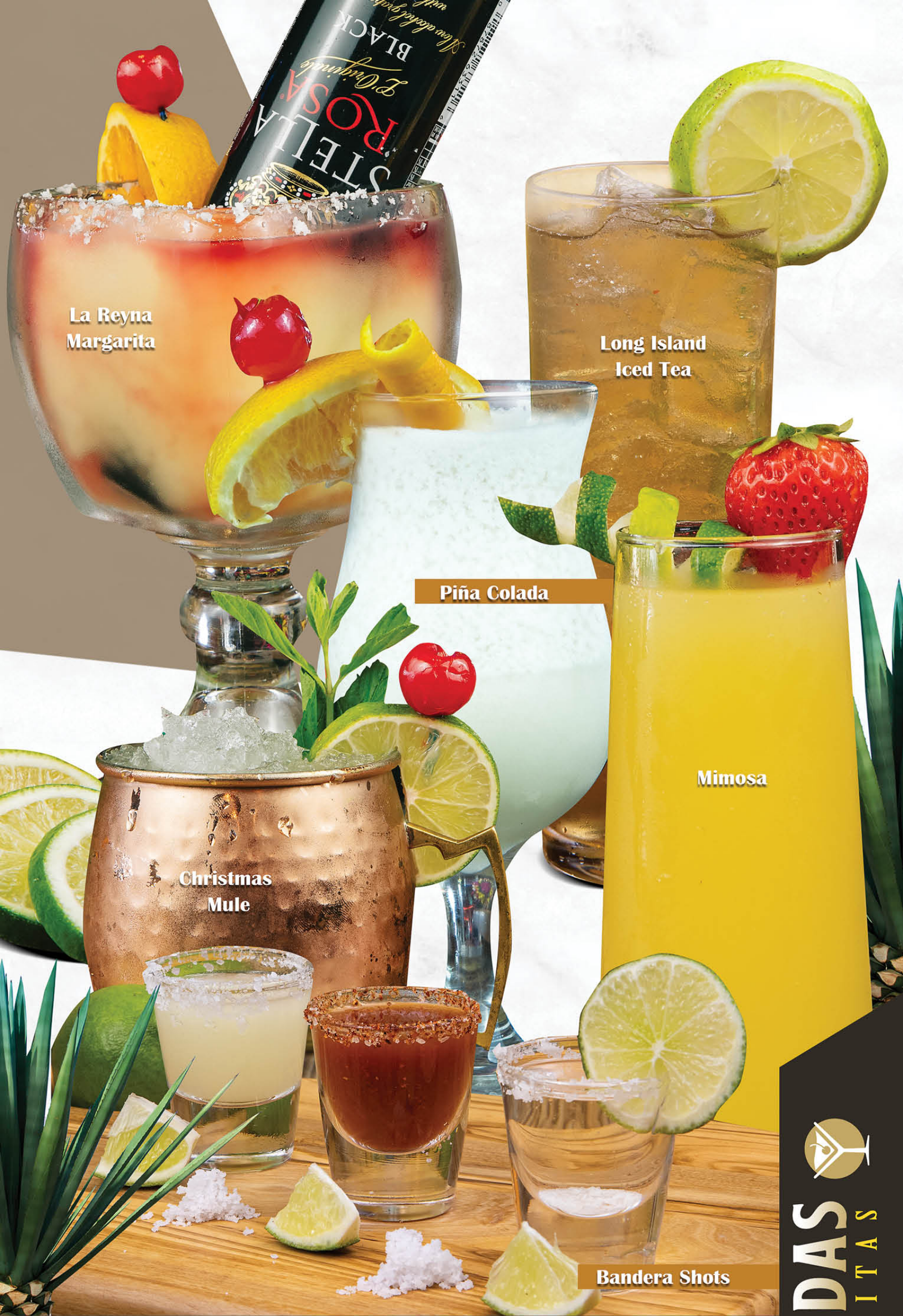
La Reyna Margarita