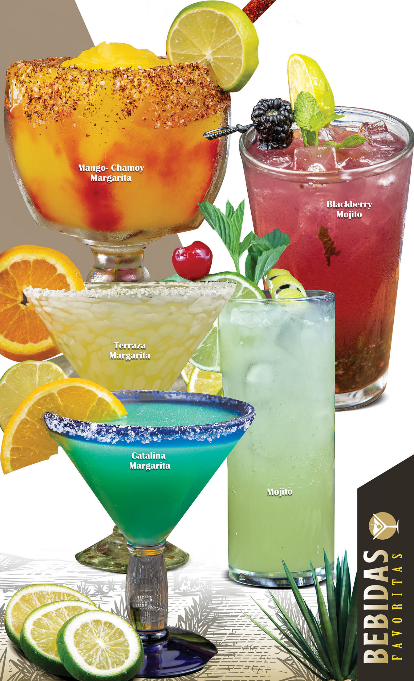
Mango- Chamoy Margarita