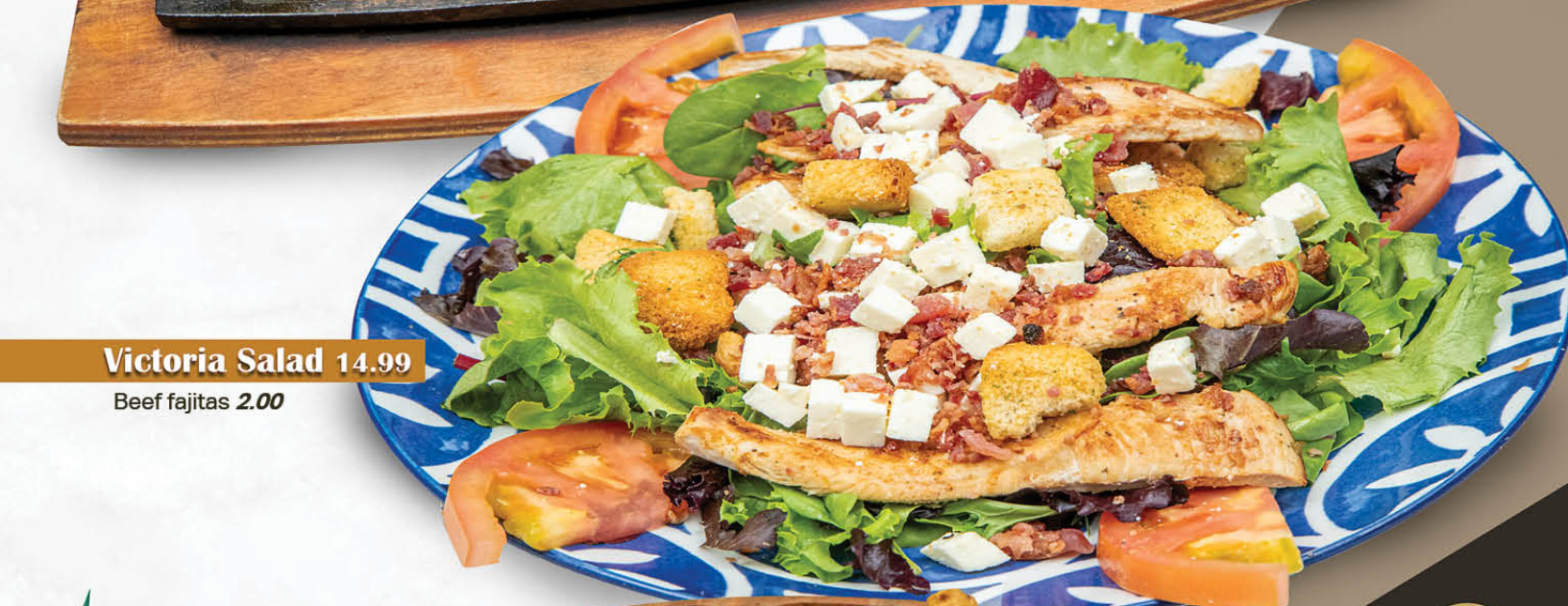
Victoria Salad 14.99