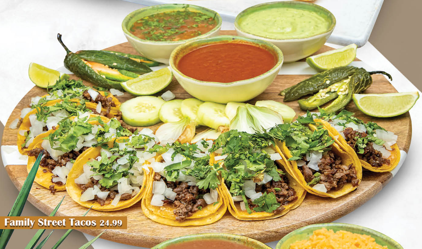
Family Street Tacos 24.99