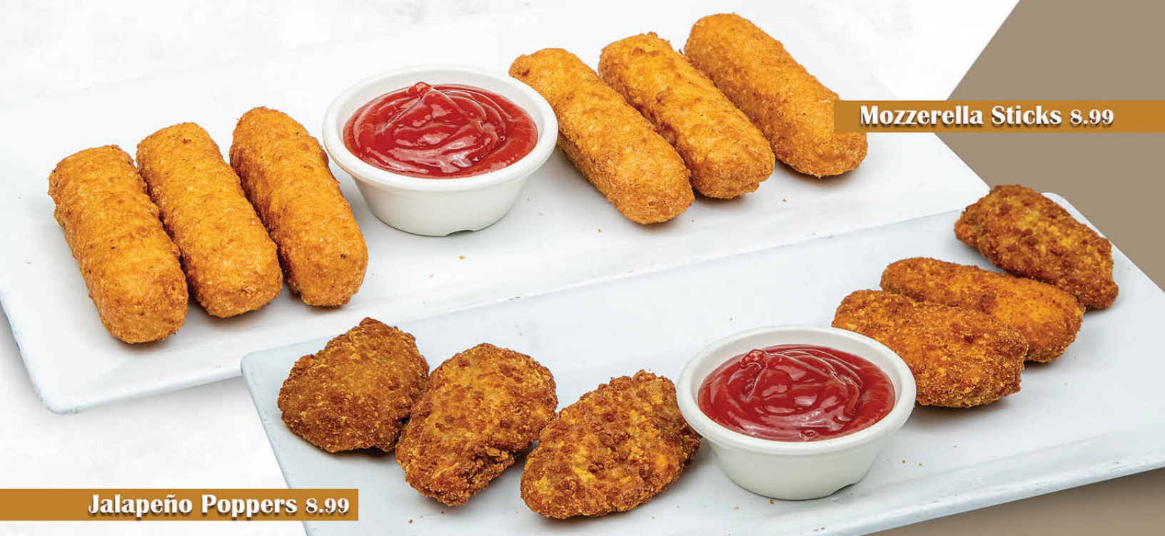
Mozzerella Sticks 8.99