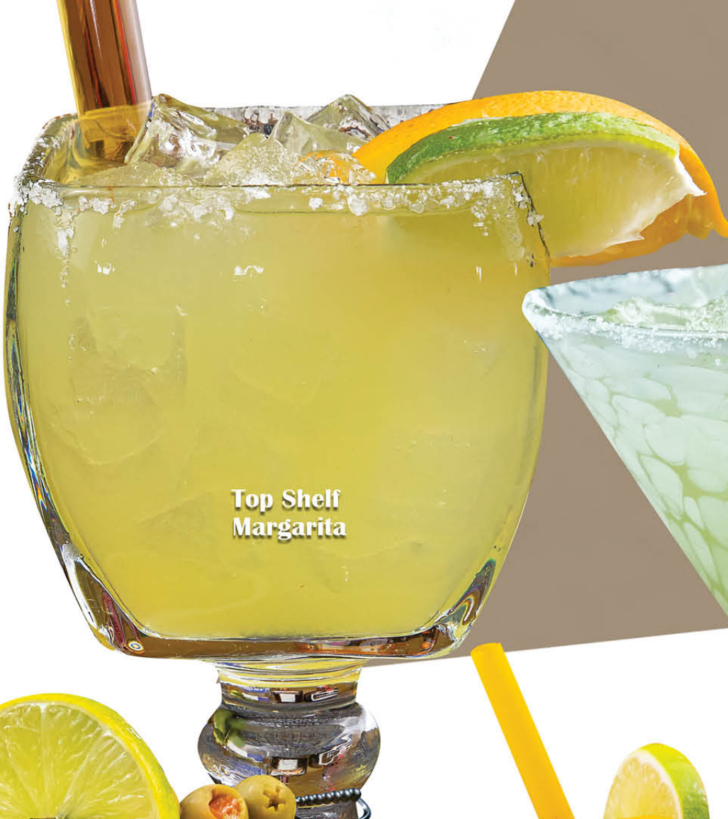
Top Shelf Margarita