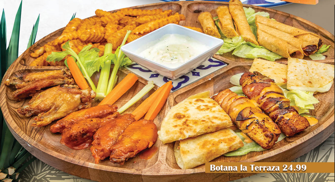
Botana la Terraza 24.99