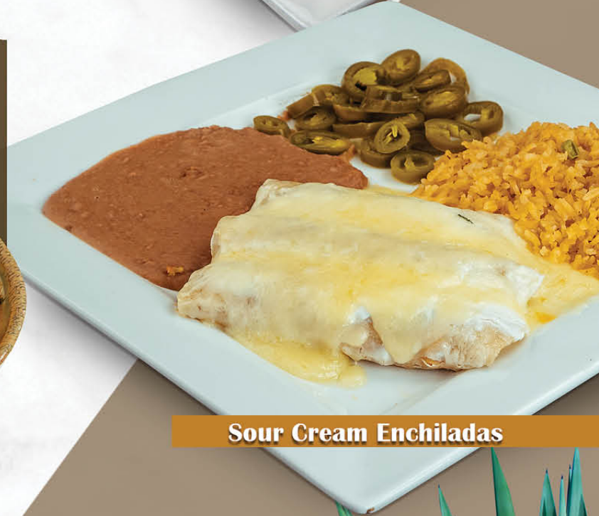
Sour Cream Enchiladas